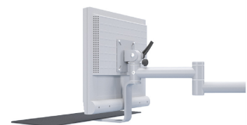
Part No. 2000494