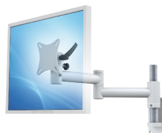
Part No. 2000490