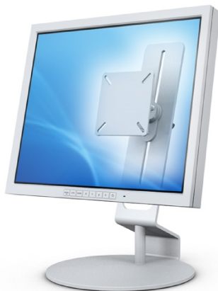
Part No. 2000398

additional Warranty: Expansion to 3 years / 4 years / 5 years Warranty