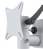
Part No. 2000492